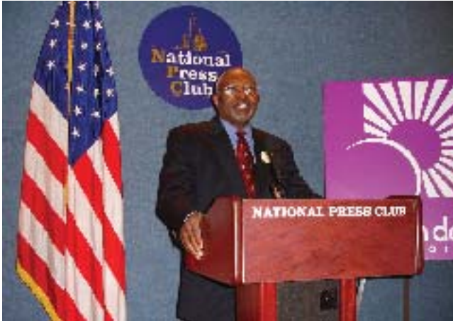
Dr. Robert D. Bullard is widely considered to be the “father of the environmental justice movement” for his pioneering work in the field.