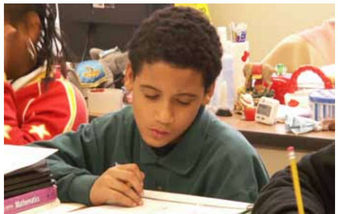
This student, along with others at People for People's SEED program, participated in entrepreneurship training and developed a business selling snacks to raise money for his SEED account.