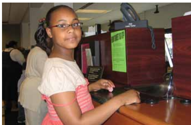
A student from Beyond Housing's SEED program makes a deposit into her SEED account. Students in SEED learned how to fill out deposit slips and read bank statements in financial education classes.

used for approved purposes. They also support accounts with an initial deposit made by the federal government that permits additional contributions and incentives for saving, and is allowed to grow tax-free. Close to seven out of every 10 respondents (69%)—and more than three-quarters of parents (78%)—articulate support for this idea (Peter D. Hart Research, 2007).