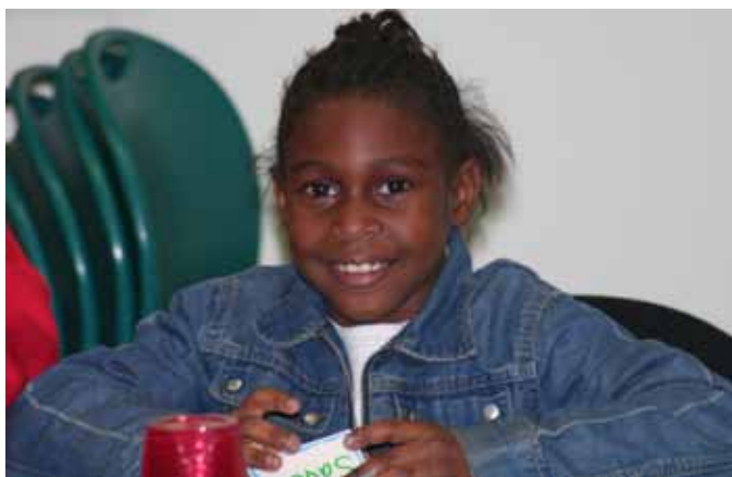
A student participates in a financial education activity, a key component of SEED programs.

The Saving for Education, Entrepreneurship and Downpayment (SEED) initiative was implemented in October 2003 after years of planning as a way to develop, test, document, and inform CDAs. Eleven community