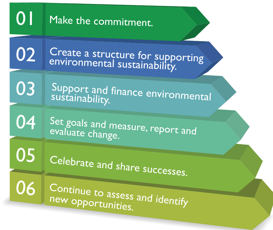
Figure 1. Six Steps to Environmental Sustainability